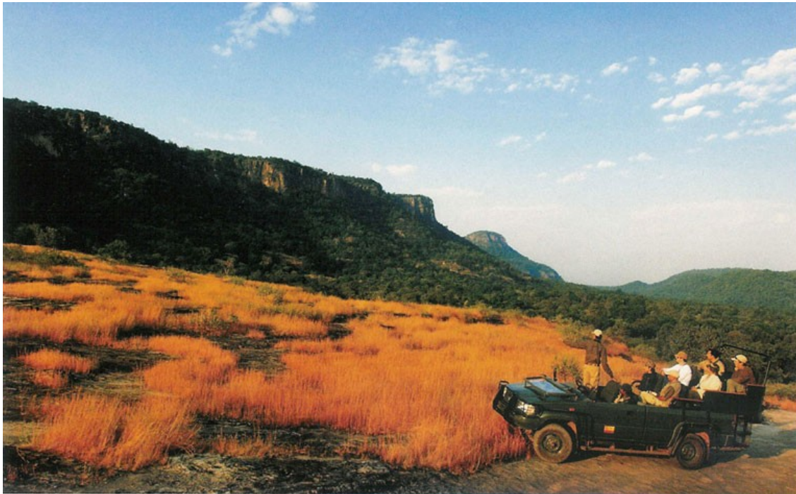
Clockwise from left A game drive at Mahua Kothi. A sambar deer. The lake at eco-friendly Shergarh, in the Kanha National Park. The Wilderness Camp borders the Thar desert

happy. The Wilderness Camp, on the edge of the Thar desert just south of Jodhpur, rises from the sand like a mirage. The elegant tents flutter in the breeze, providing an exotic contrast with the desert wilderness. The camp is renowned for its horseback safaris.